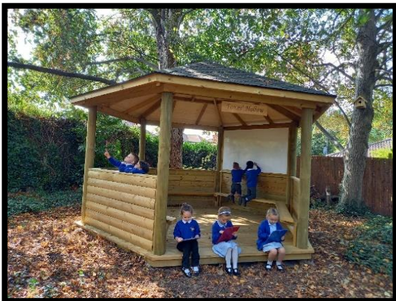
The Outdoor Classroom