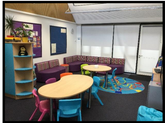
The Family Room