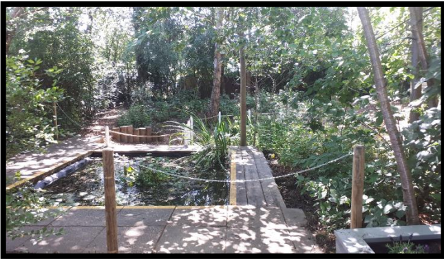
Our pond in Foxes' Hollow